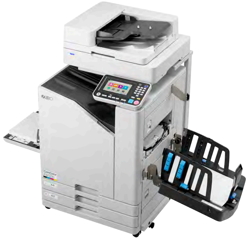
(Pictured: ComColor FW5230 with Scanner attachments)

Call your local RISO dealer today and learn about our FW Series RISO’s designed for Churches and Non-Profit organizations.